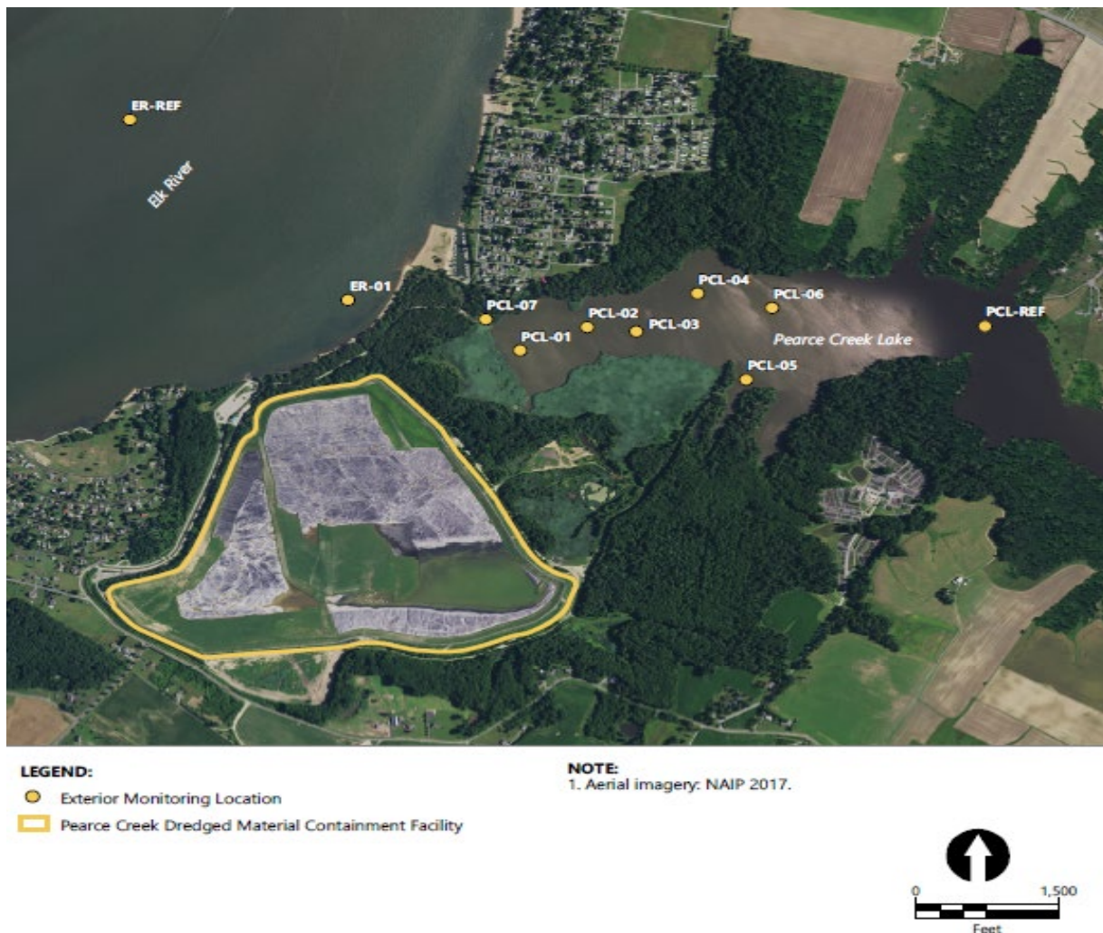
FIGURE 1. EXTERIOR MONITORING LOCATIONS

This monitoring event is the seventh post-placement monitoring event since dredged material placement began in late 2017 at the Pearce Creek DMCF. Monitoring results indicated that water discharge from the Pearce Creek DMCF have not had an adverse effect on the aquatic environment in Pearce Creek Lake. The frequency of exterior monitoring events beyond those planned through the fall of 2022 will be determined through adaptive management.